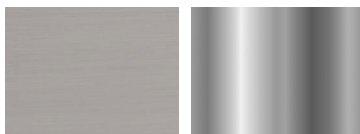
BN Brushed Nickel PN Polished Nickel