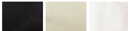
203 Black Silk Dupioni 206 Ivory Silk Dupioni 209 White Silk Dupioni

All specifications and dimensions subject to change without notice.