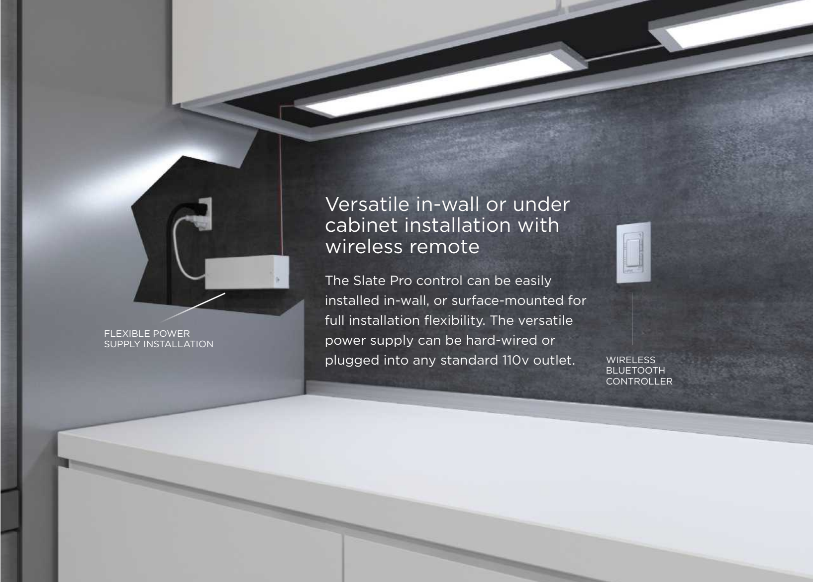
FLEXIBLE POWER SUPPLY INSTALLATION