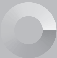
FULL-RANGE DIMMING CONTROL