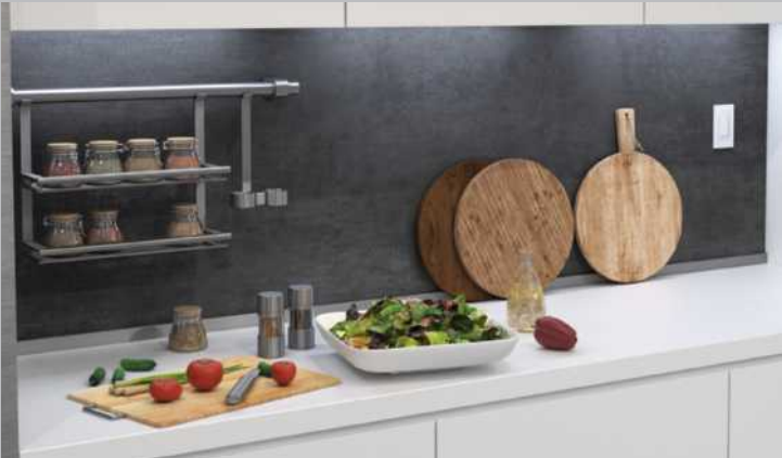
4000K Cool White