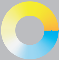
FULL-RANGE WARM-TO-COOL COLOR CONTROL

Slate's dual adjustment has been designed to give control over lighting the kitchen environment. While preparing food for dinner guests, a full brightness may be preferred, with color temperature set to a cool and clean visibility level. When company arrives, a more sociable mood can be created by bringing the dimmer down and adjusting to a warm setting.