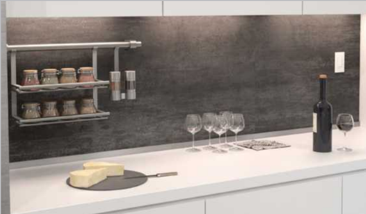
2700K Warm White