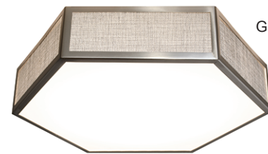
Grey Linen Fabric