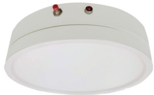
Shown on EGRF (SOLD SEPERATLEY)