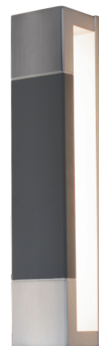
Satin Nickel/Dark Grey