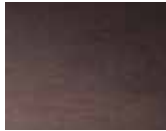
RB Hand-Rubbed Bronze