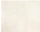
303 White Linen

All specifications and dimensions subject to change without notice.