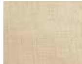
301 Beige Linen