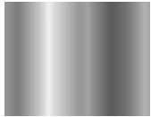
PN Polished Nickel