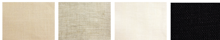
301 Beige Linen